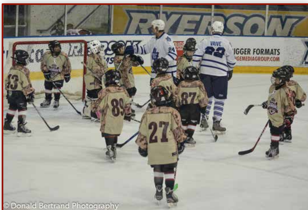
Minor Hockey All Stars – HHC at its best