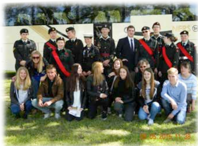
Belgian and Canadian youth at Frezenberg 8 May 2015