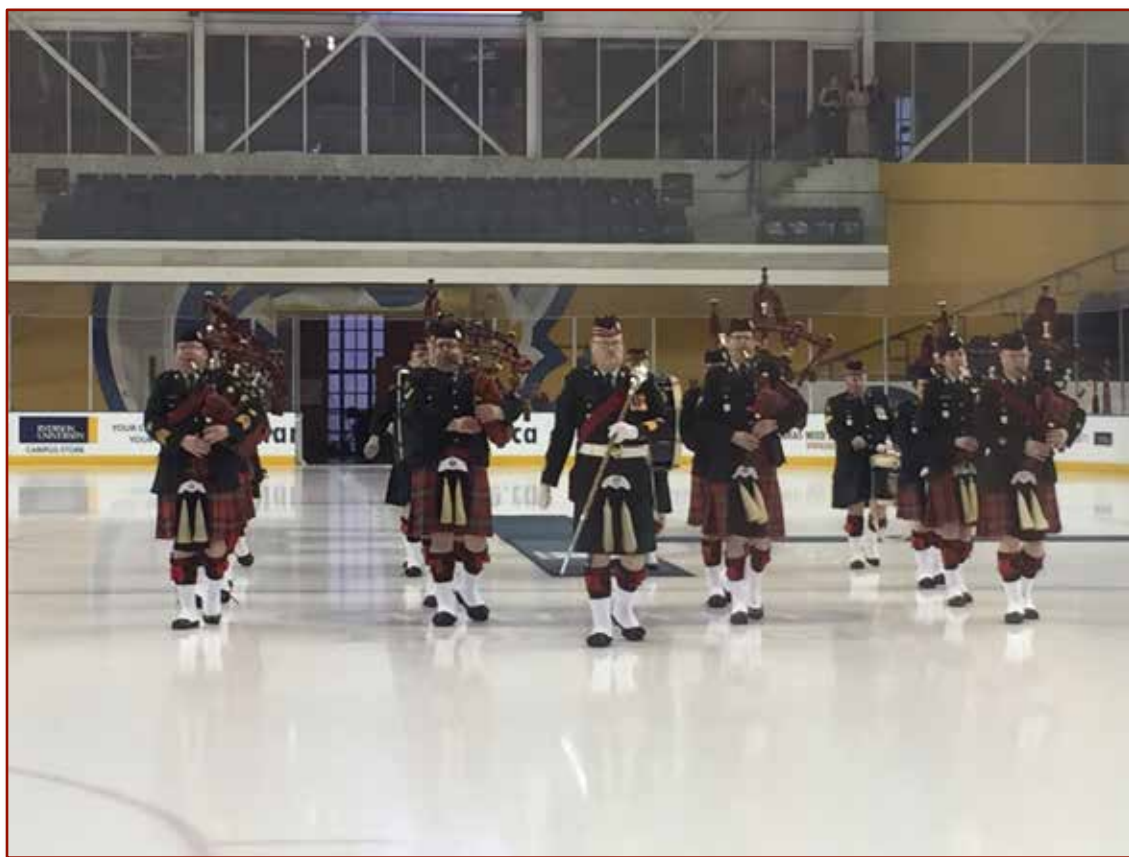
48 th Highlanders Pipes and Drums