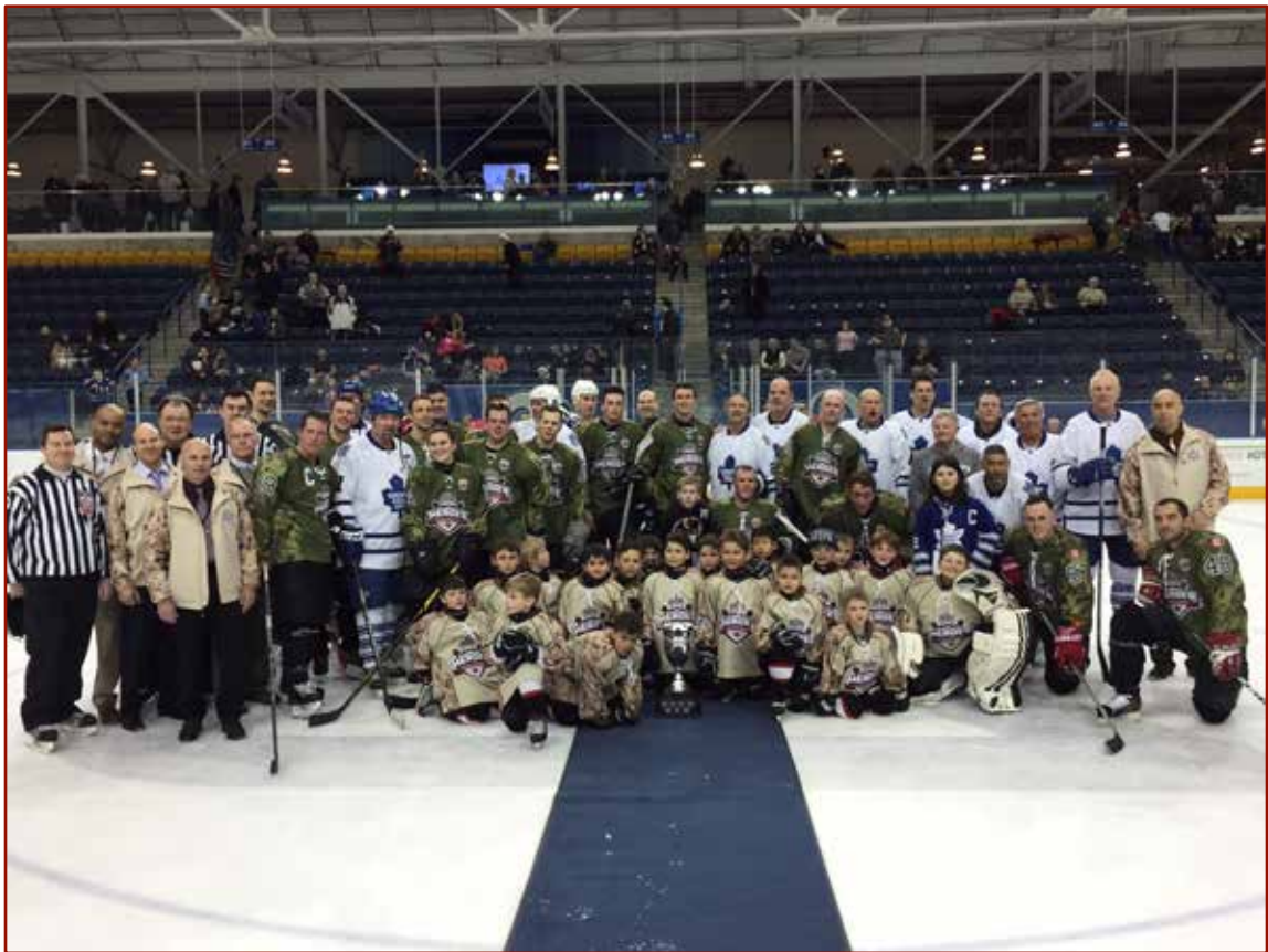
Heroes Hockey Toronto Warriors Team, Toronto Maple Leafs Association Team, Little League Team All Stars, coaches, trainers, and referees.

providing the communications support to get the word out. Approximately 5,000 people attended a great game. There was as much entertainment on the ice as there was off the ice. The aim was met and everyone commented how much they enjoyed the idea of supporting our soldiers and their families with an exciting event.