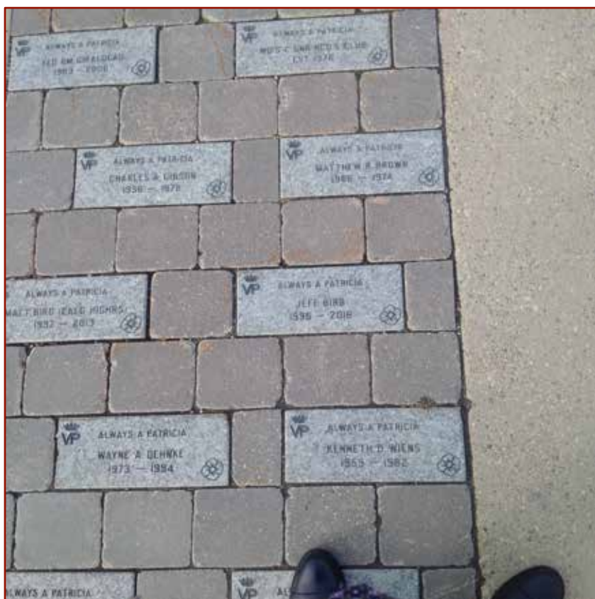
Some Installed stones as pictured in spring of 2015.

2015 saw a total of 38 stones installed at Patricia Park. Sales for 2016 are significantly slower for 2016 with only two confirmed orders. A renewed marketing plan will be forthcoming this year but word of month continues to be the best vehicle to spread the word. Sales for the PLS can also be taken by the two kitshops. Malcolm Bruce has taken back all duties relating to the PLS until such time as we resolve the office staffing. Contact details remain through those listed on the website.